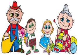
National Grandparents Day

The Parish office will be closed Monday, September 4, 2017 in observance of Labor Day.