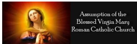
Assumption of the Blessed Virgin Mary Roman Catholic Church